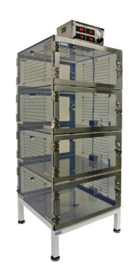
Inert Gas Purging System