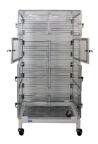
Dual Side Access Cabinets