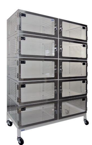
Clear Acrylic / SD PVC