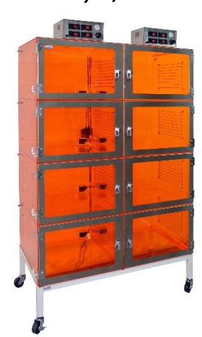
UV Amber Acrylic