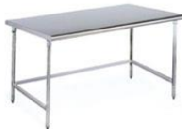
14 Gauge 304 Grade Cleanroom Stainless Steel Tables Perforated top; allow a minimum 40% laminar flow