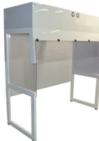
VERTICAL AIR FLOW HOODS

Work Space Dimensions: 37", 49", 73" or 97" W x 31"D x 70"H Consists of an integrated Fan Filter module 90 fpm air velocity Filter Replacement Indicator Build-in LED Light Tilt-up Clear PVC Sash Meet ISO5 Class 100 cleanliness requirements